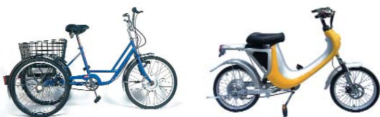
5 Speed Powatryke