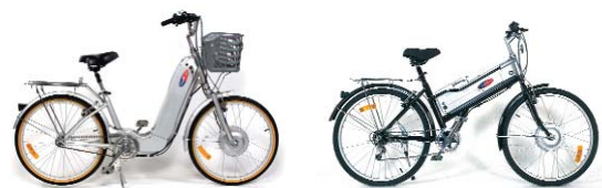
1 & 6 Speed Shopper