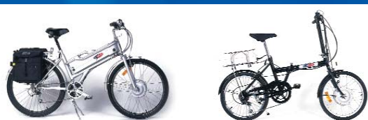
24 Speed Commuter